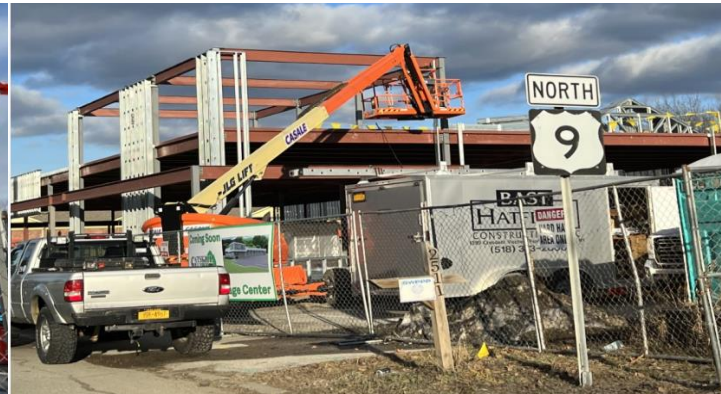
One Step Closer