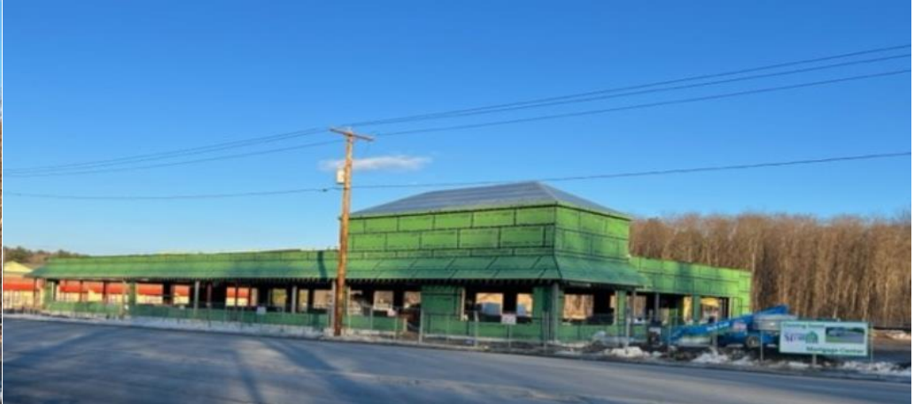
Moving Right along!