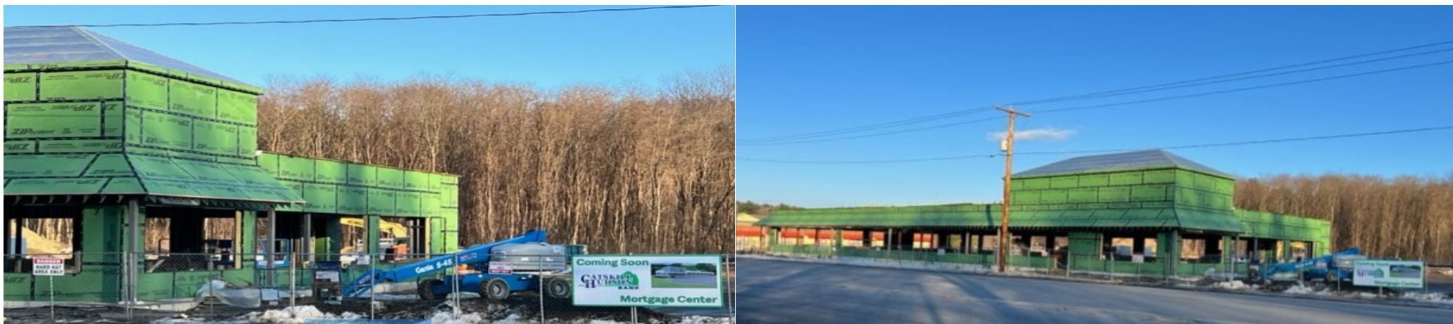
Moving Right along!